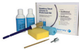
Stainless Steel Cleaner Kit

For shearing stainless steel cables up to 1/4" diameter.