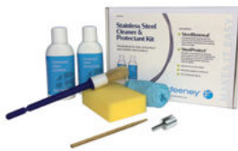
Stainless Steel Cleaner Kit

For shearing stainless steel cables up to 1/4" diameter.