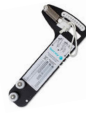
Cable Tension Gauge

Clean and maintain all stainless steel surfaces, fittings, and cables.