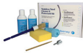
Stainless Steel Cleaner Kit

For shearing stainless steel cables up to 1/4" diameter.