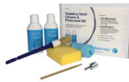
Stainless Steel Cleaner Kit

For shearing stainless steel cables up to 1/4" diameter.